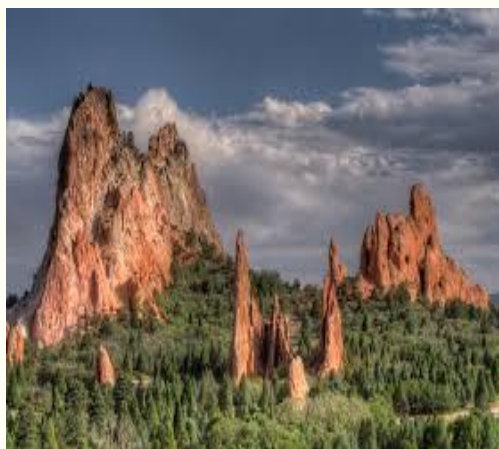
Garden of the Gods