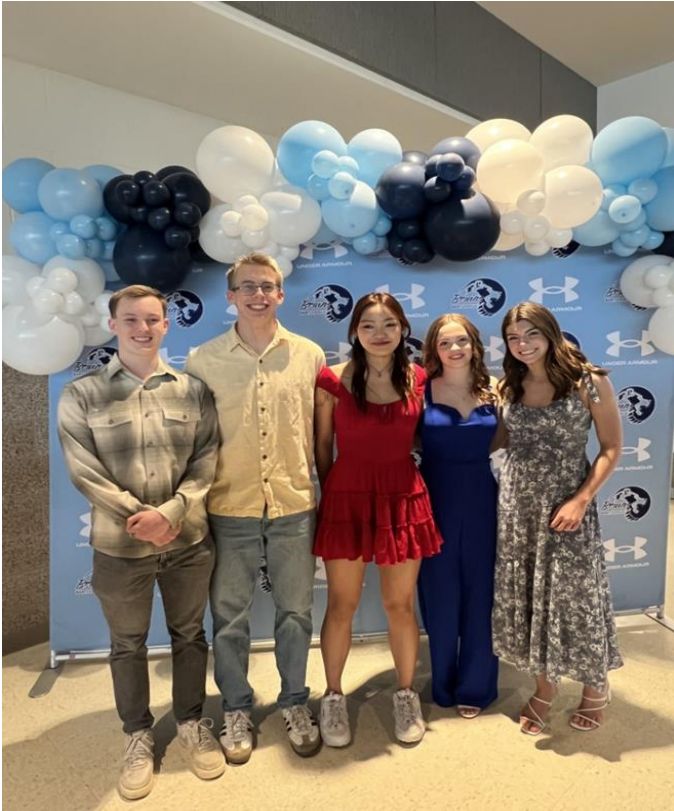
Some of our 2025 Graduating Seniors