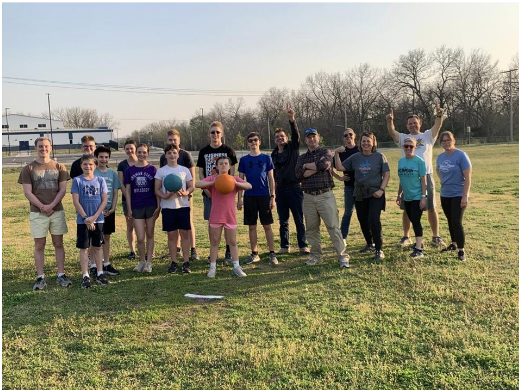
Rents vs. Runts