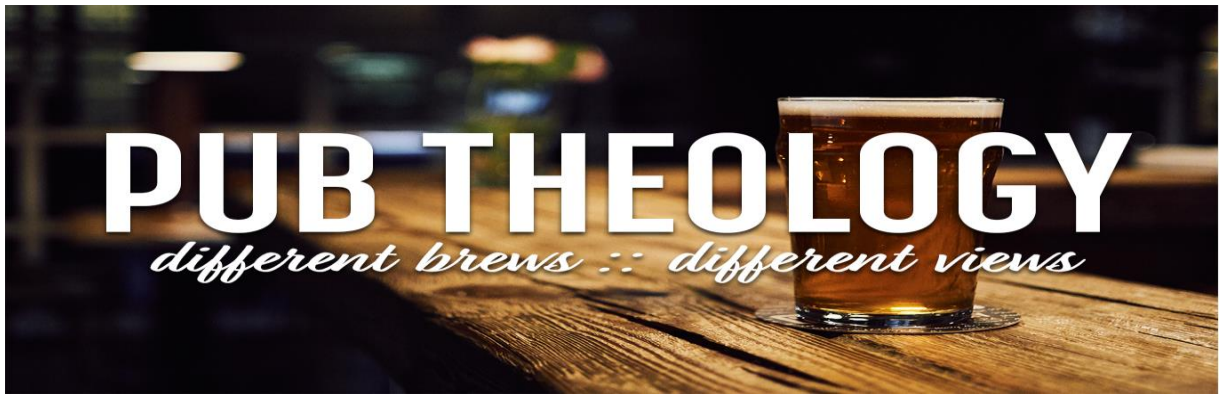
This Thursday (June 27th), 6:30pm, at Tumbleweed's