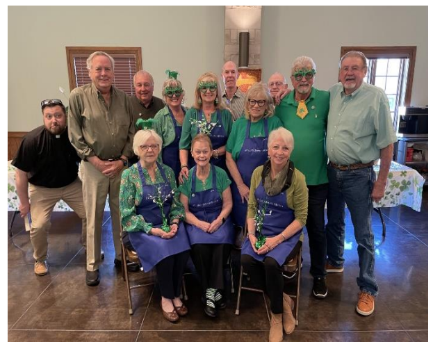
Our wonderful Brunch Bunch ..... and their little leprechaun