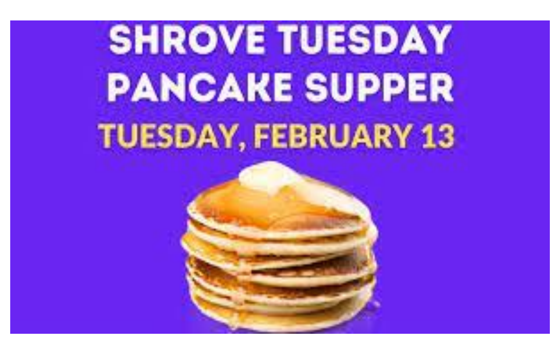
Let's celebrate Mardi Gras together!

Come and have Dinner with us on Fat Tuesday!