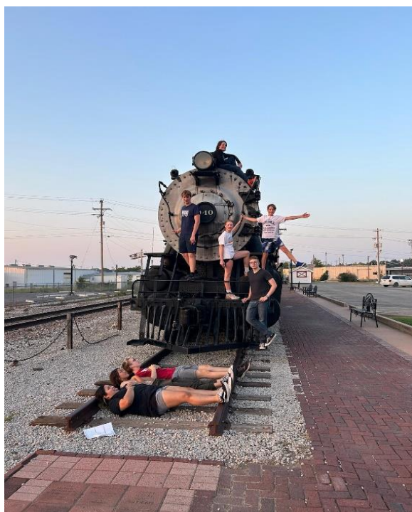
The Winning Photo