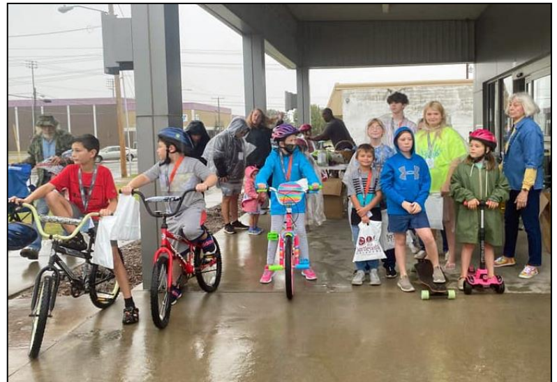
Tour de Bville riders head out on a wet Saturday, Oct. 2

We've continued to provide evening meals and other food supplies despite the challenges of the Covid pandemic, which temporarily curtailed in-church housing of homeless families. St. Luke's is scheduled to provide meals for the last time this year the week of Nov. 14-20.