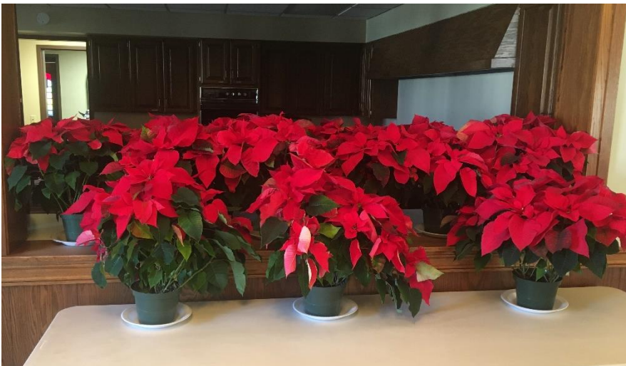
Poinsettia plants from Christmas are available for the taking in Metcalf Hall on a first-come, first-serve basis. There are still plenty available.

The Oklahoma Episcopal Diocese will hold the "Created in the Image" Retreat for high school students on March 27 as part of a series of four separate retreats, held once a year, at which difficult topics our youth experience at school and in society and how our faith frames these experiences will be discussed. The retreats are facilitated by youth ministers from around the Diocese under the direction of the Director of Youth/Young Adults. The cost is $125 each. Register at epiok.org or call the Diocese to learn more at 405-232-4820. Details of each year's retreat are on the website. Four-year participants will be recognized by the Diocese at their home congregations.