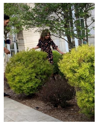
The Hunt is On!